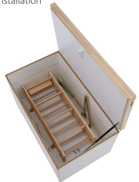
Designo Passivhaus, with upper and lower trapdoors to help achieve excellent energy efficiency