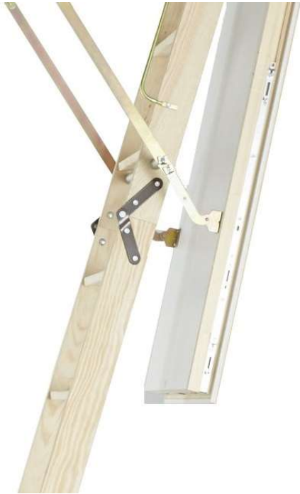
Designo wooden loft ladder with highly insulated trapdoor for improved energy efficiency