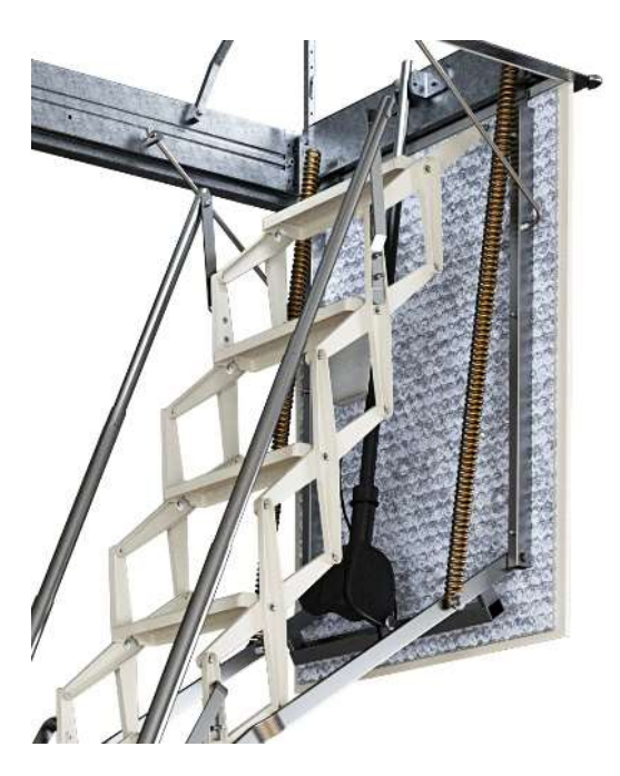
Escalmatic electric loft ladder with insulated trapdoor and double handrail

Material: Operation: Load capacity: U-value: Max floor-to-ceiling height: Quality: Warranty: