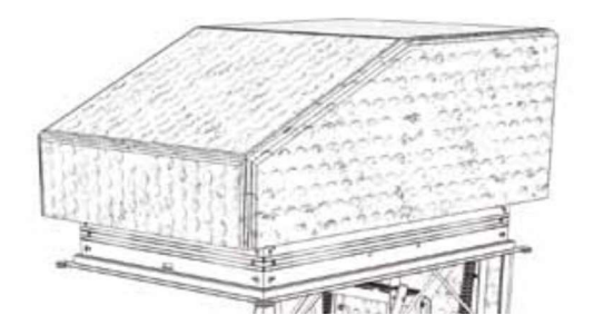
Patented 'Thermocover' for additional insulation