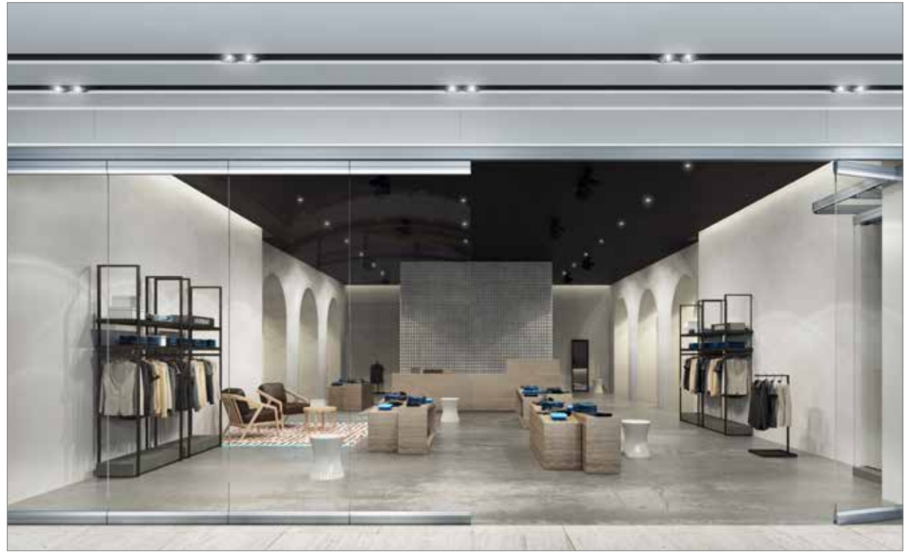
Installation situation