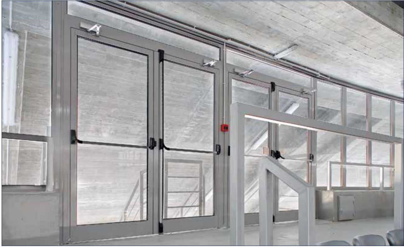
Sports hall, Zadar, Croatia