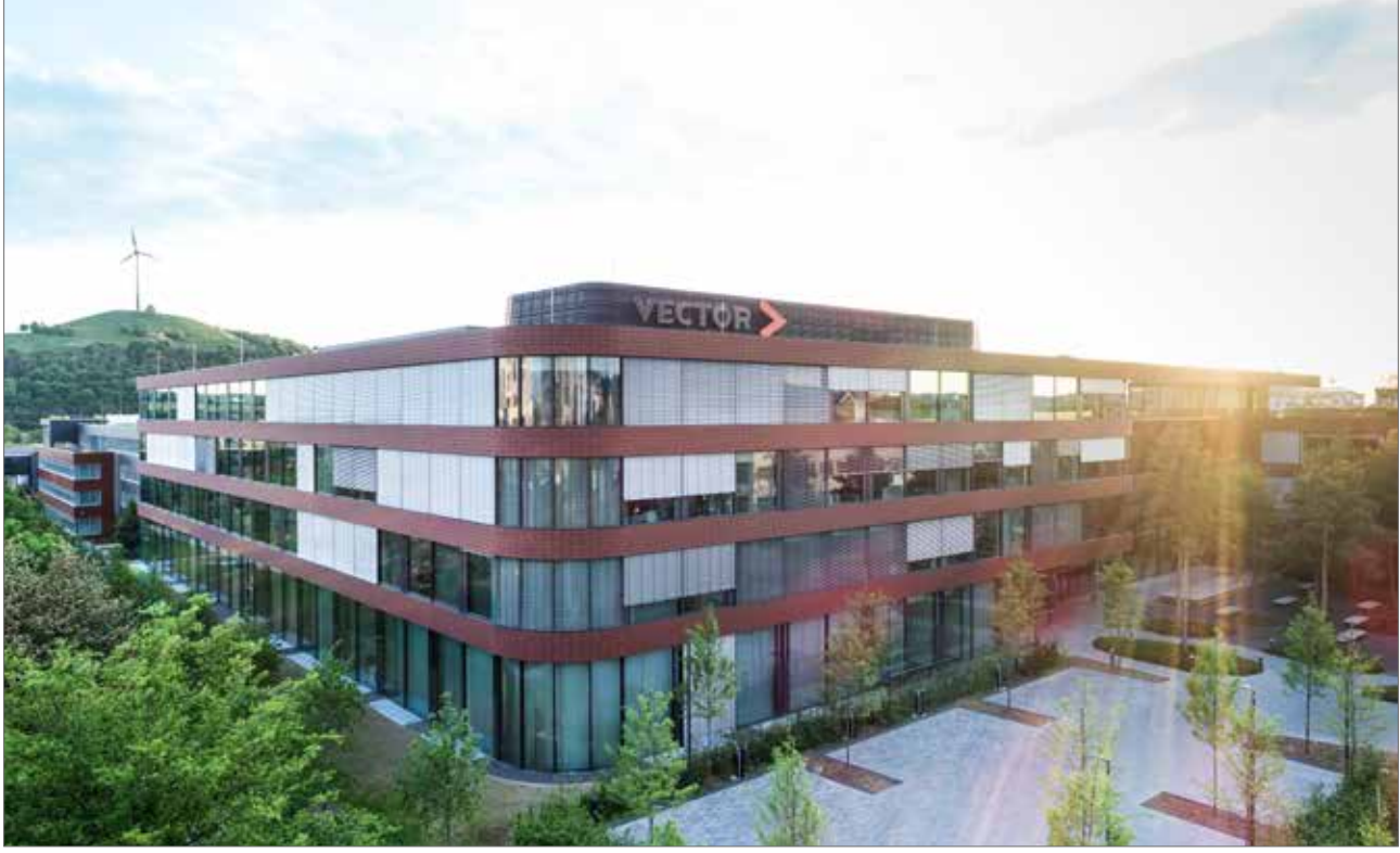
Vector Informatik headquarters, Stuttgart, Germany