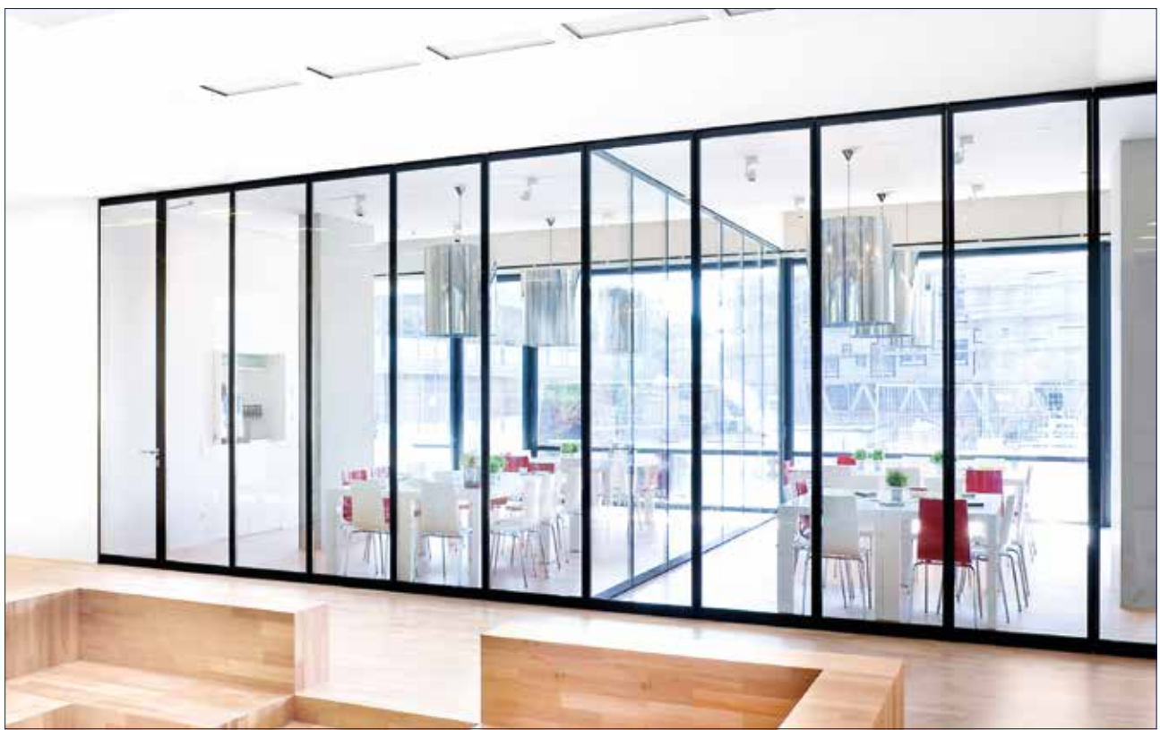
Ronald McDonald House, Tübingen, Germany