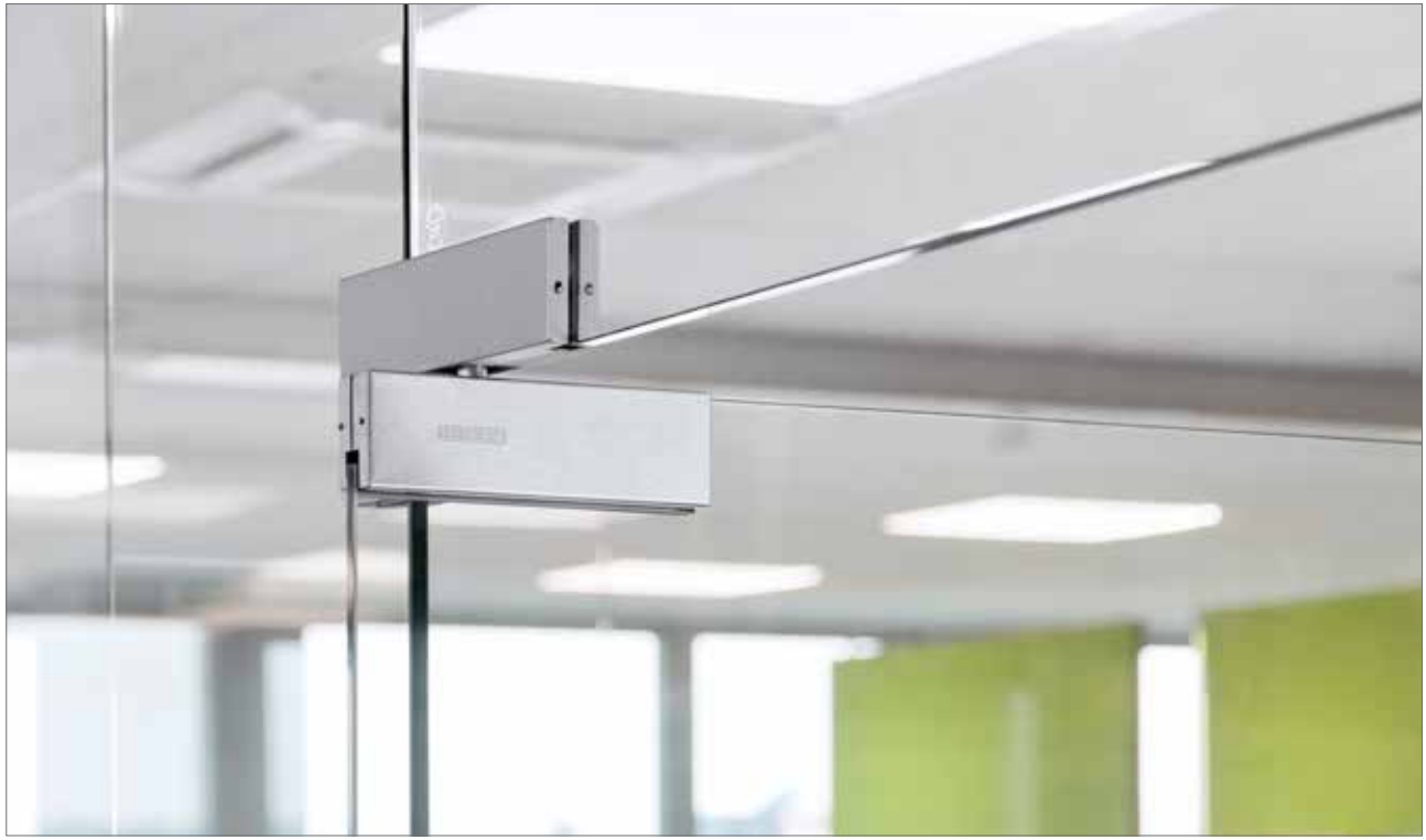
Installation situation, residential building