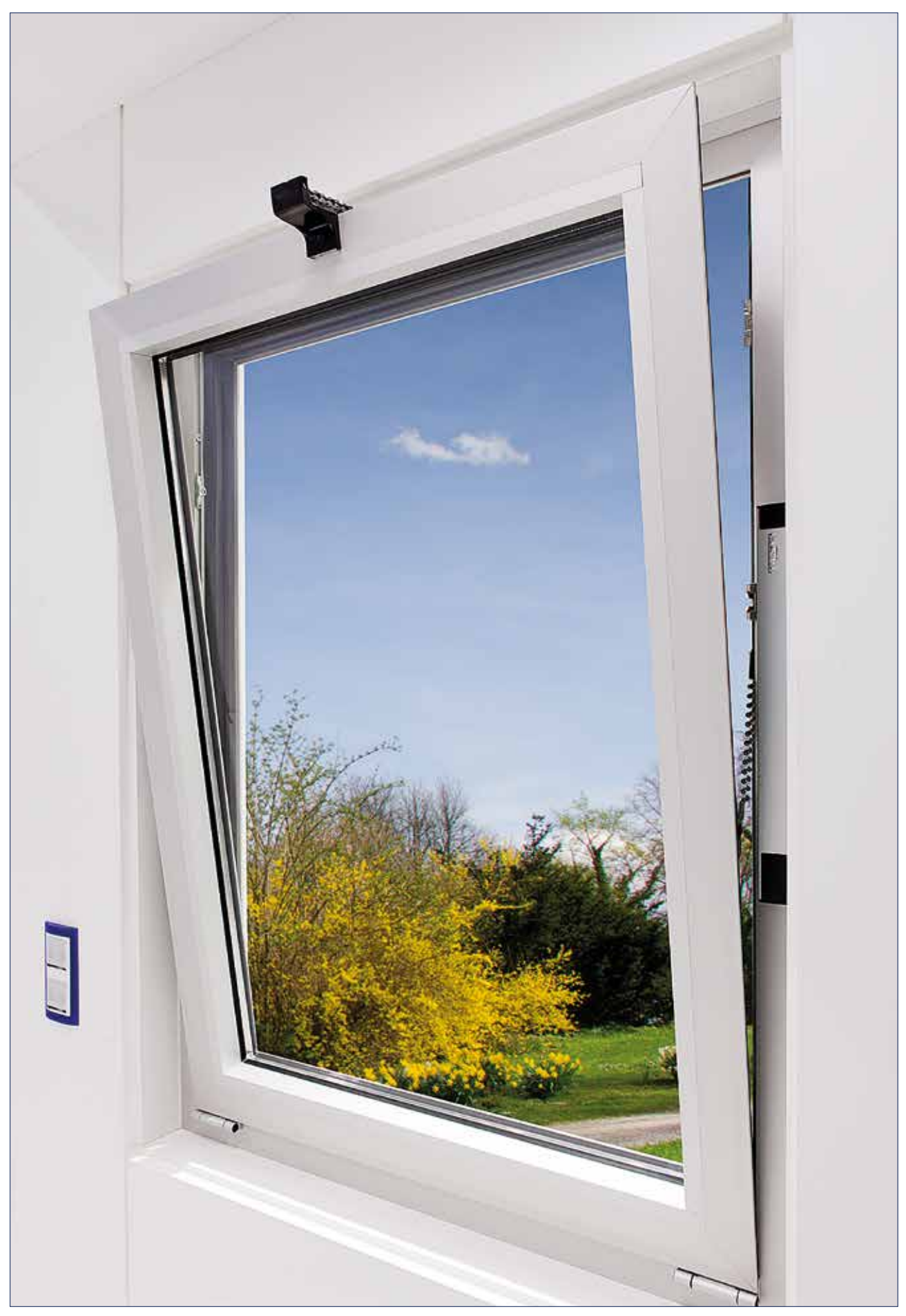
Installation situation