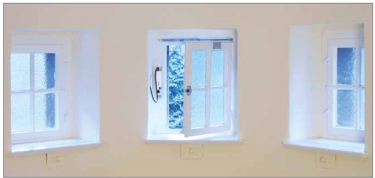
Installation situation