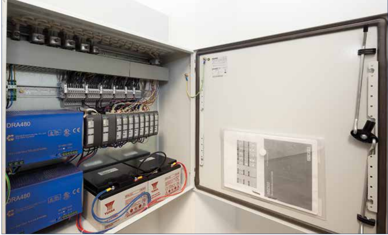
Augustinum, Stuttgart, Germany