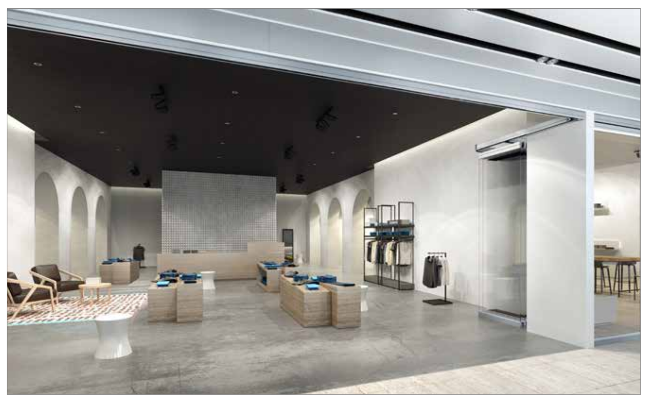
Installation situation