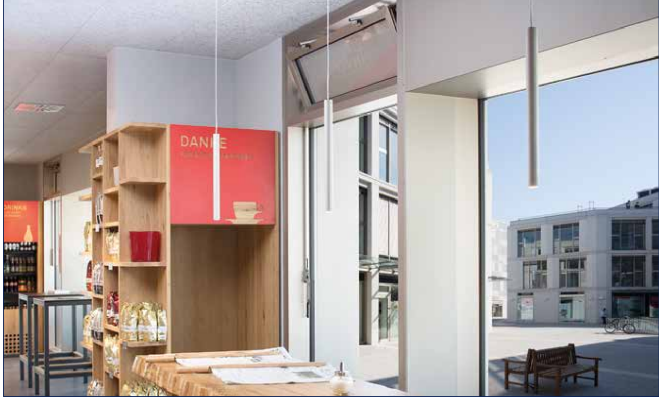
Killesberg, Stuttgart, Germany