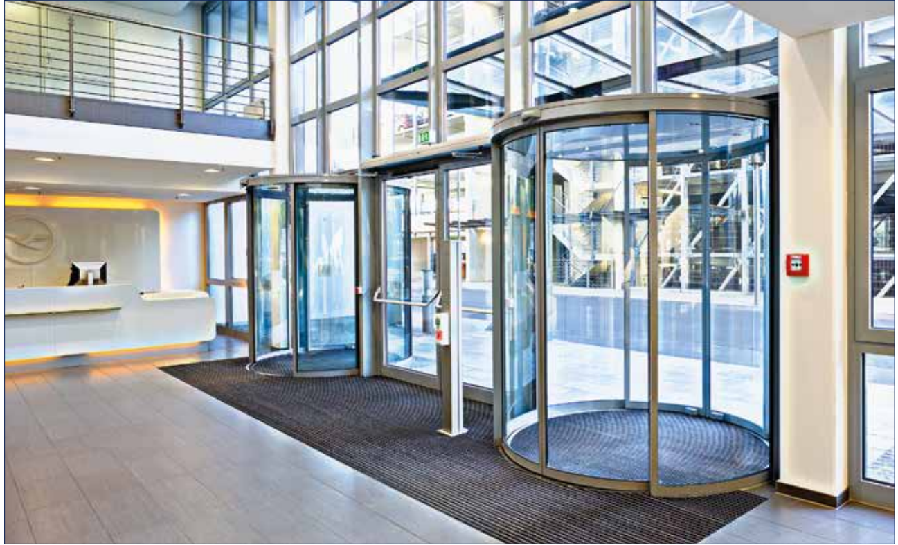
Lufthansa, Cologne, Germany