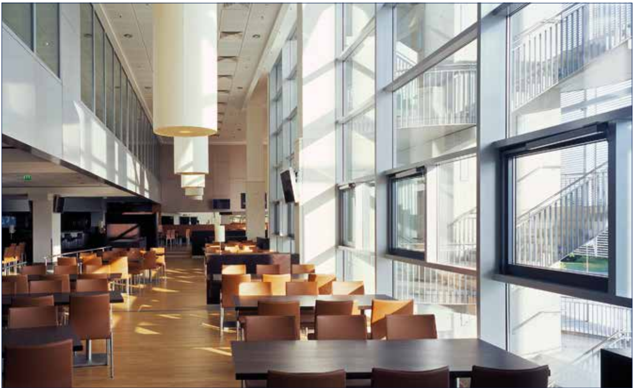
LTU Arena, Düsseldorf, Germany