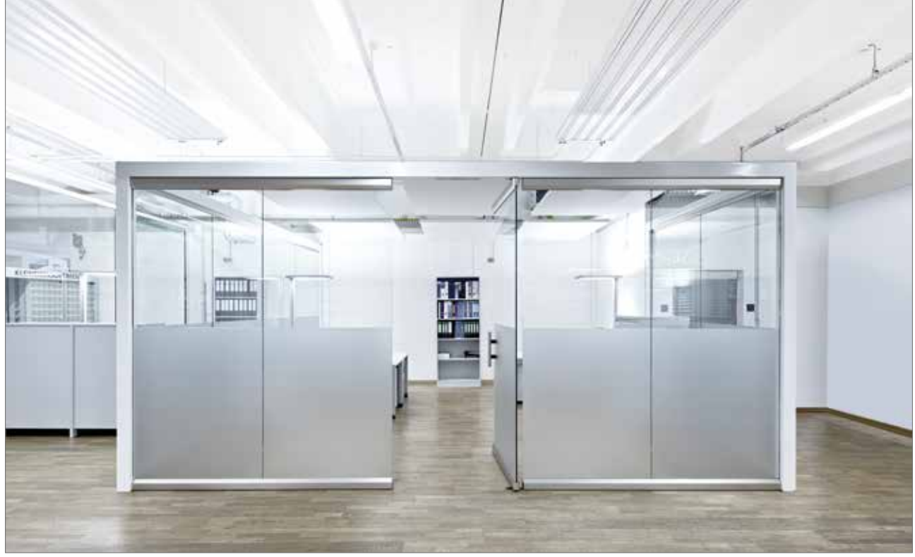
Meesenburg GmbH, Flensburg, Germany