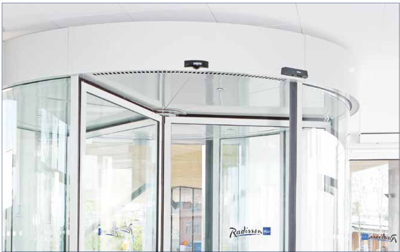
Radisson Blue Hotel, Uppsala, Sweden