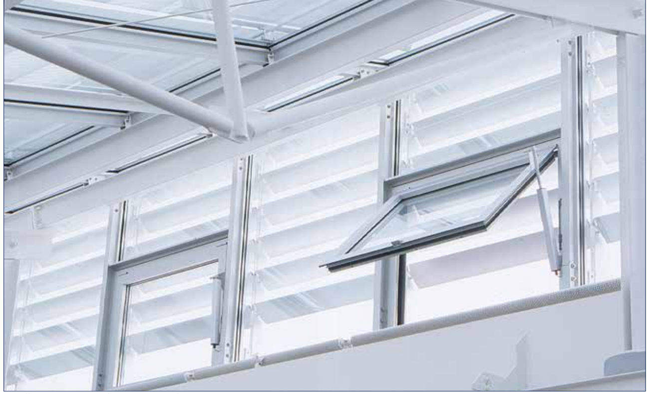
Installation situation