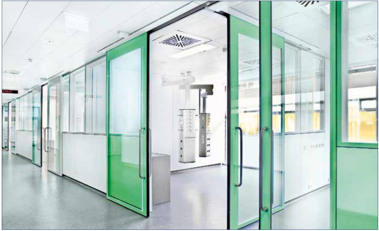
Düsseldorf Hospital, Germany