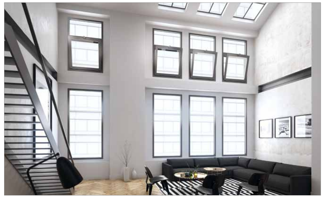
Installation situation