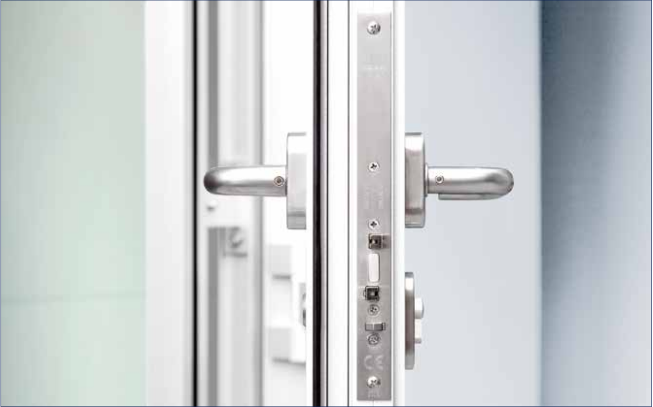
Vector, Stuttgart, Germany