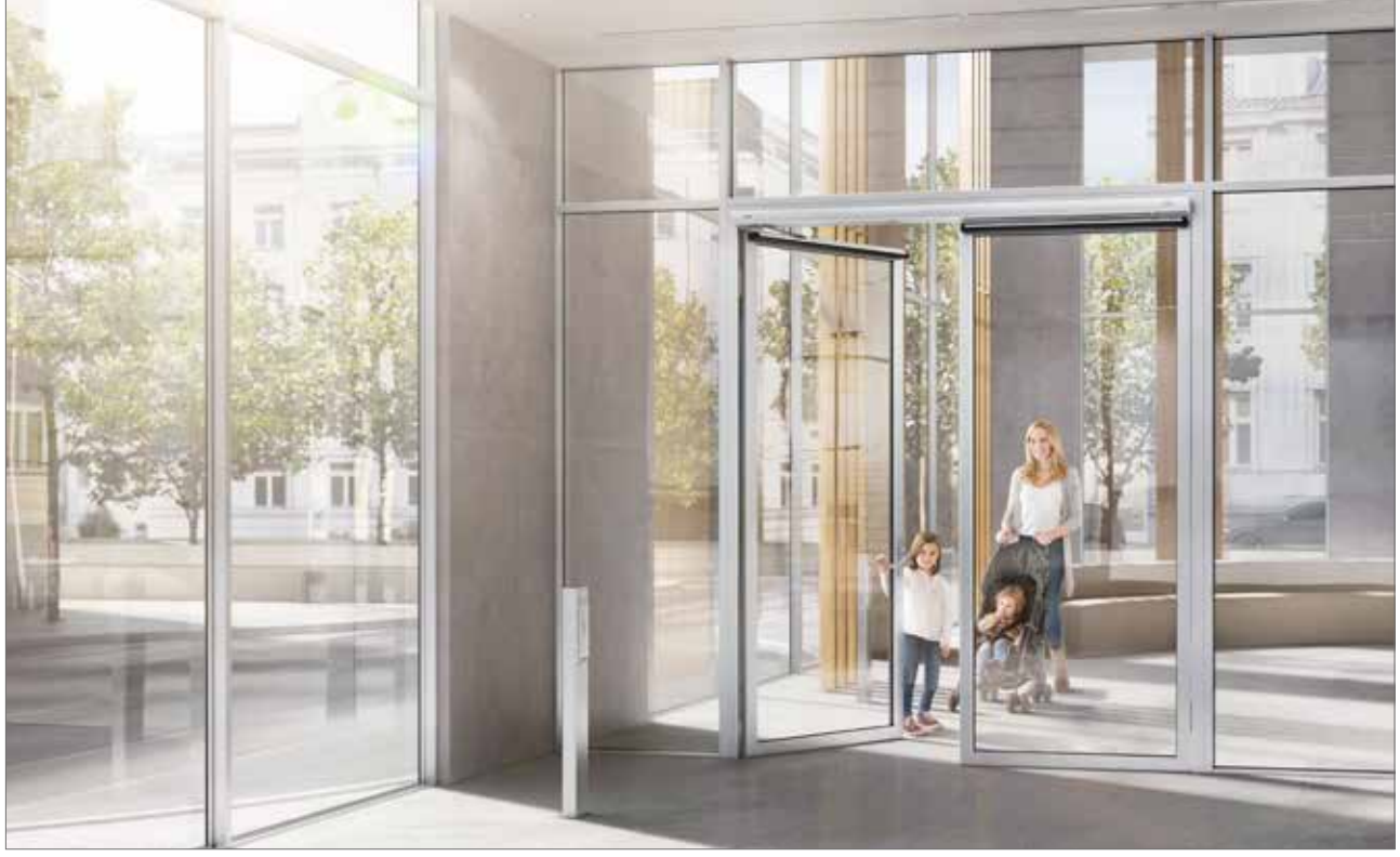
Installation situation