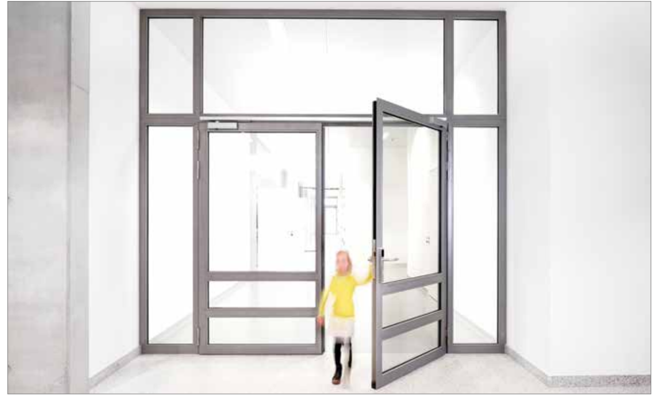
Robert Bosch Hospital, Stuttgart, Germany