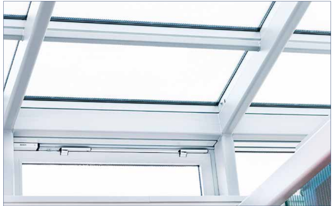
VGH Versicherungen, Hanover, Germany