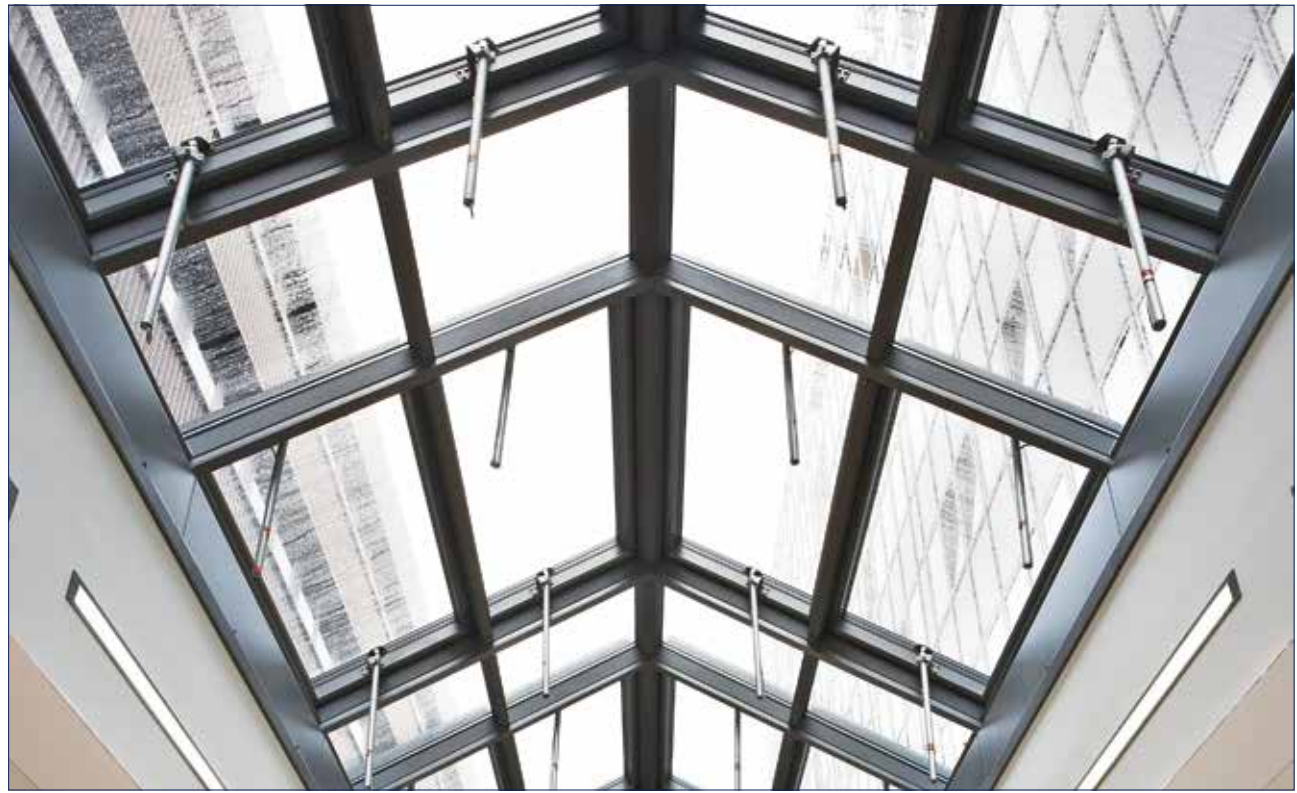
Saarbrücken Station, Germany