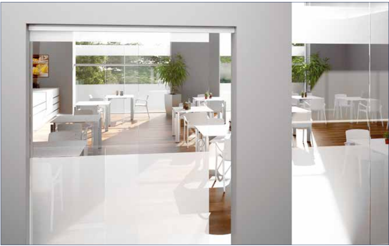
Installation situation, Restaurant