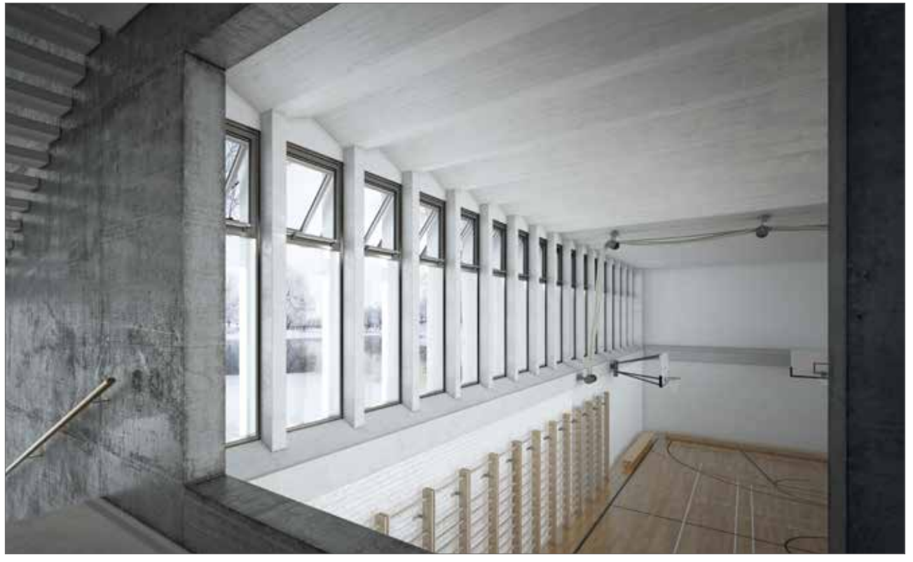
Installation situation