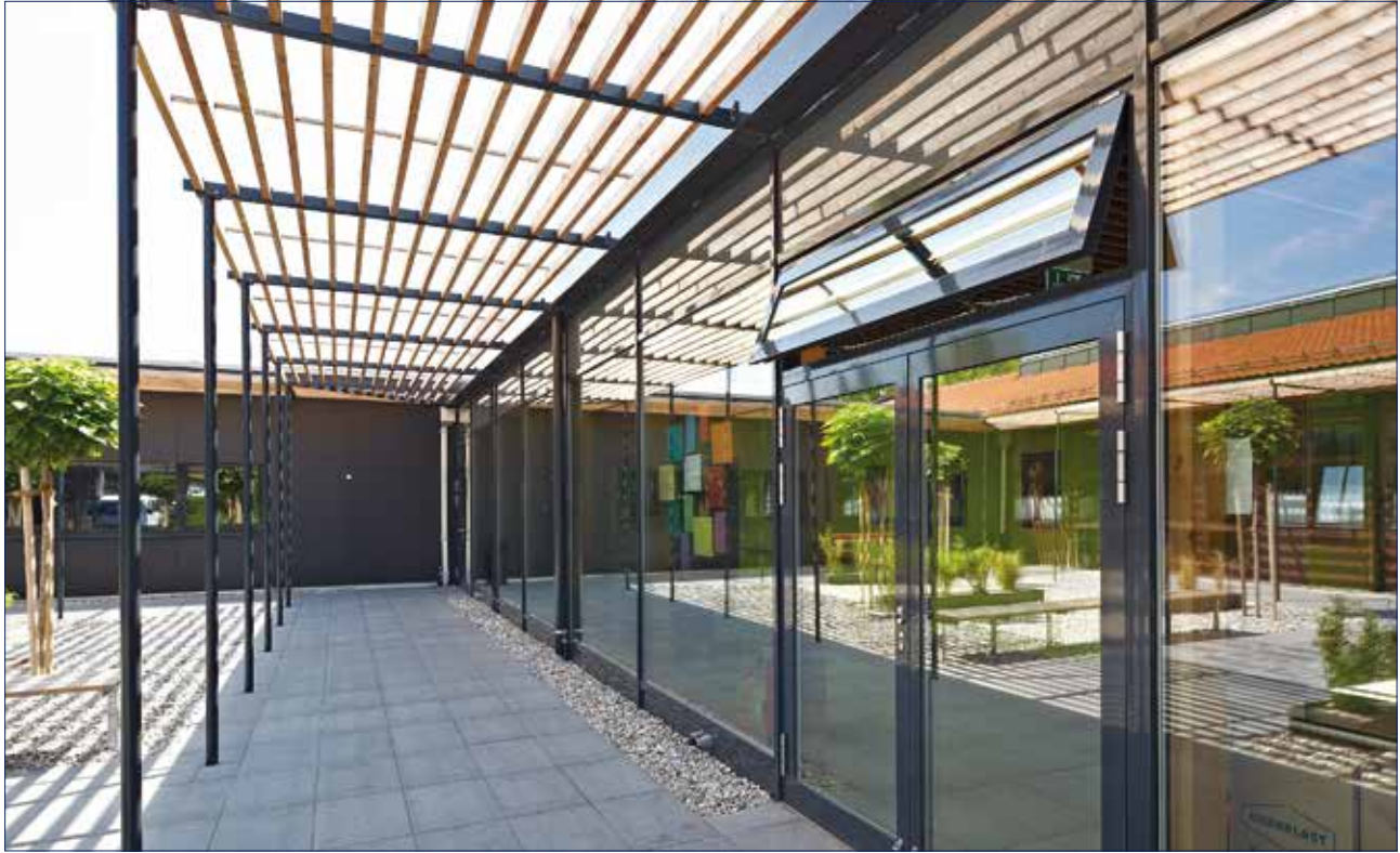
Ecksberg Foundation, Mühldorf, Germany