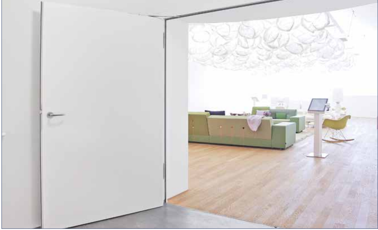
Vitra Haus, Weil am Rhein, Germany