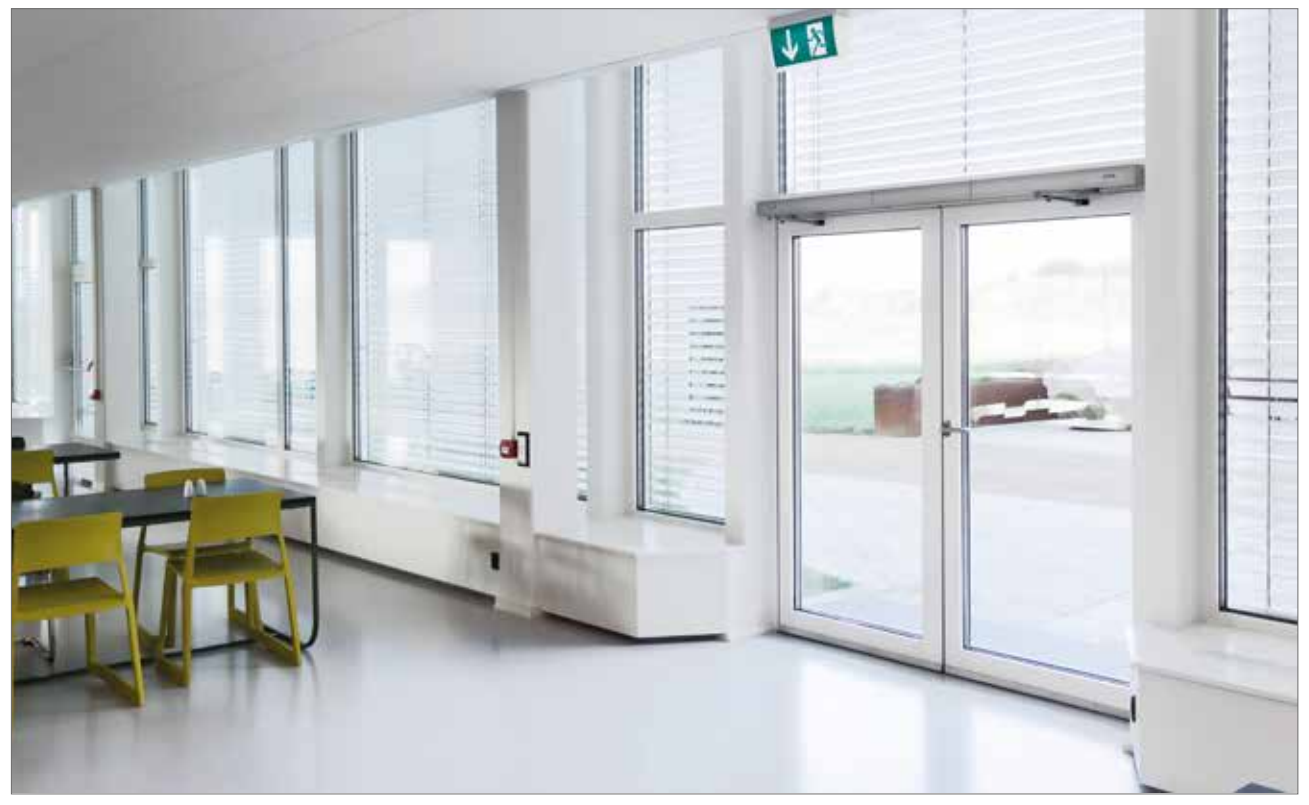
Danish association for people with disabilities, Taastrup, Denmark