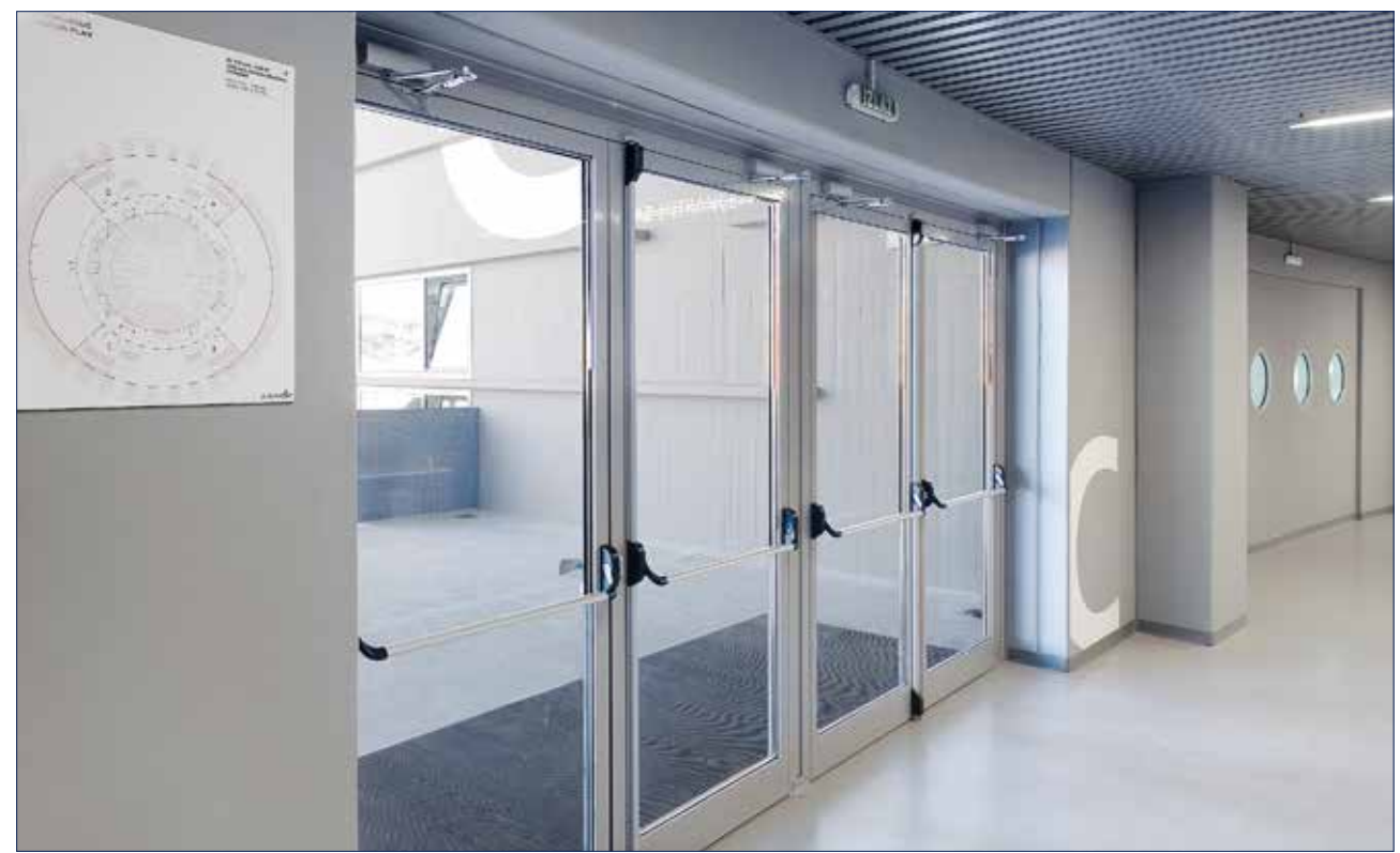
Sports hall, Zadar, Croatia