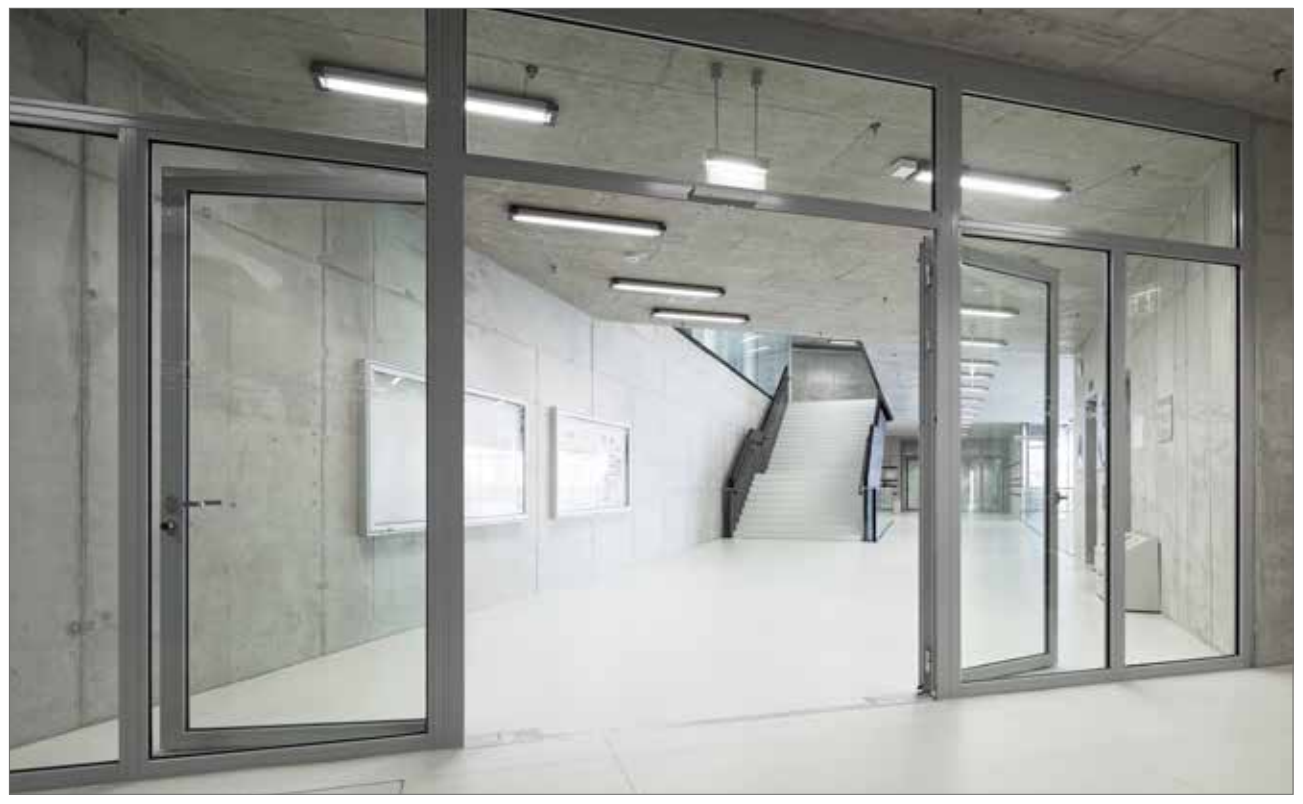
HafenCity University Hamburg, Germany