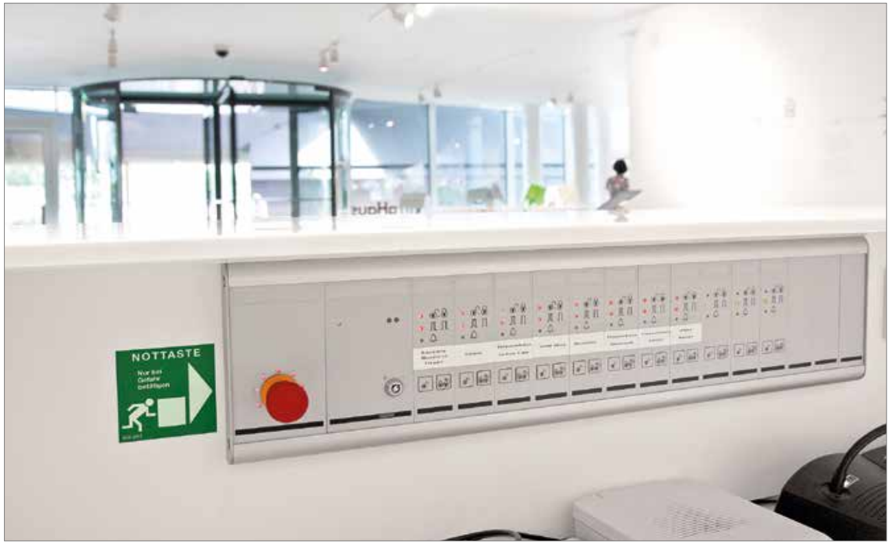
Vitra Haus, Weil am Rhein, Germany