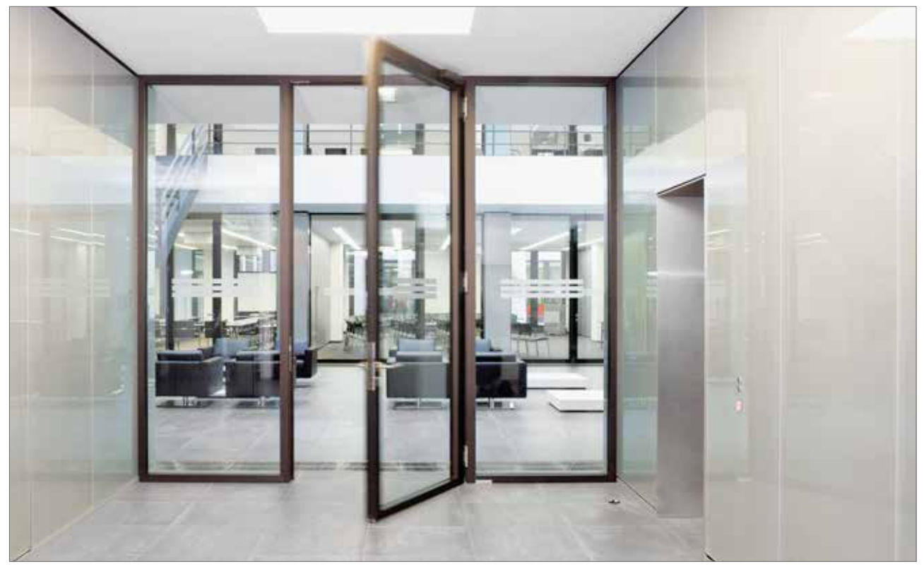
Generali, Cologne, Germany