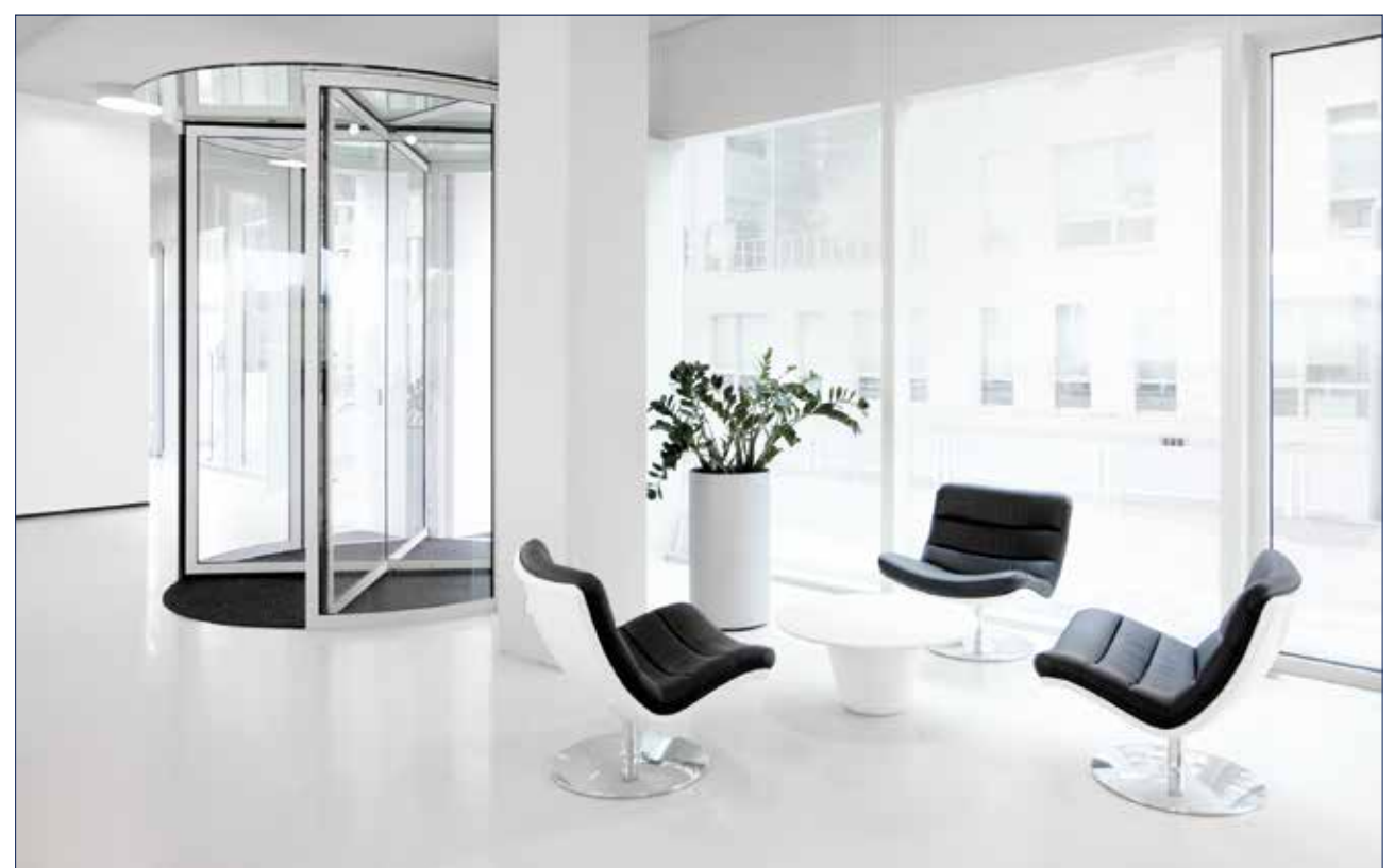
Flight Forum, Eindhoven, The Netherlands