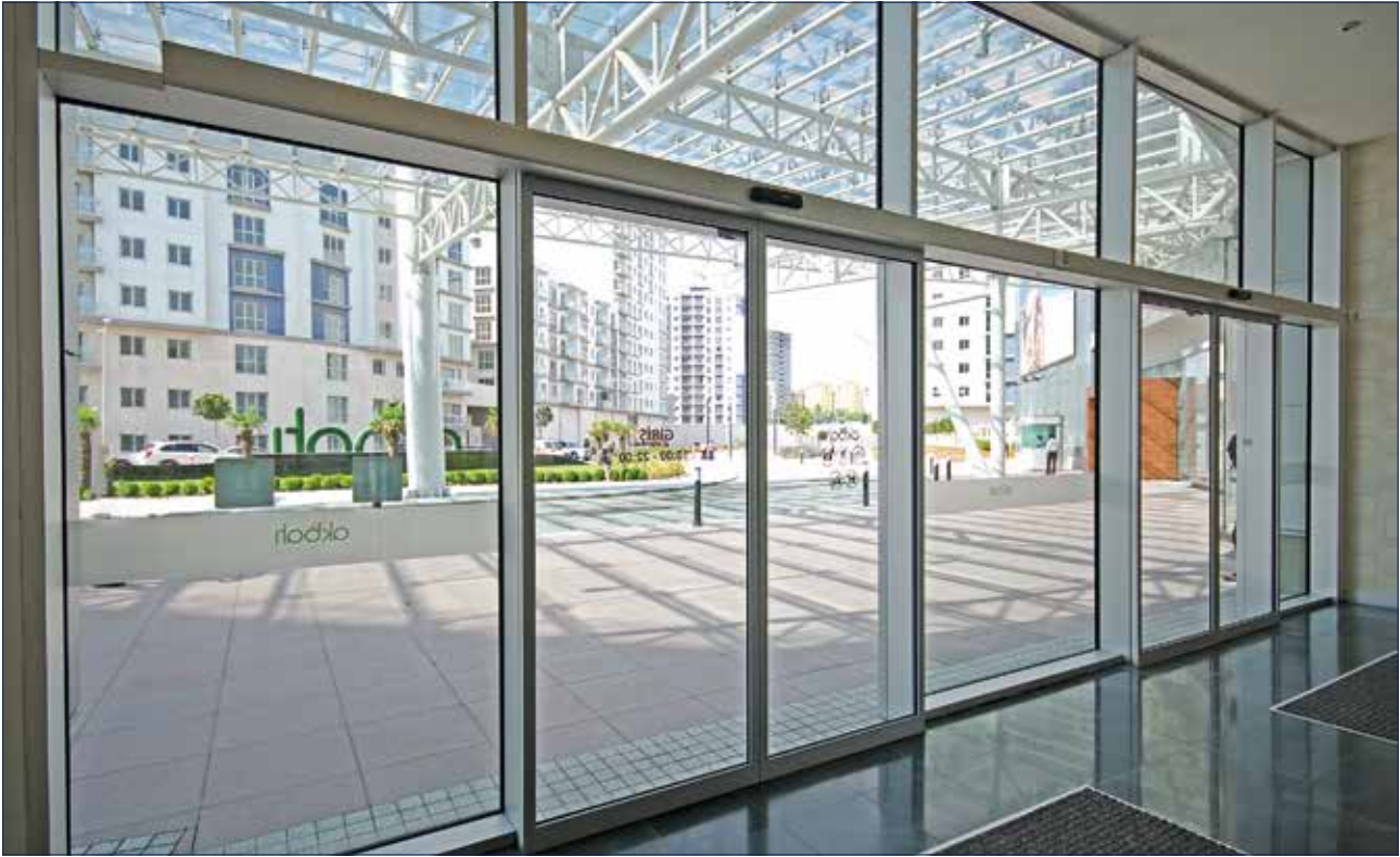
Akbati, Istanbul, Turkey