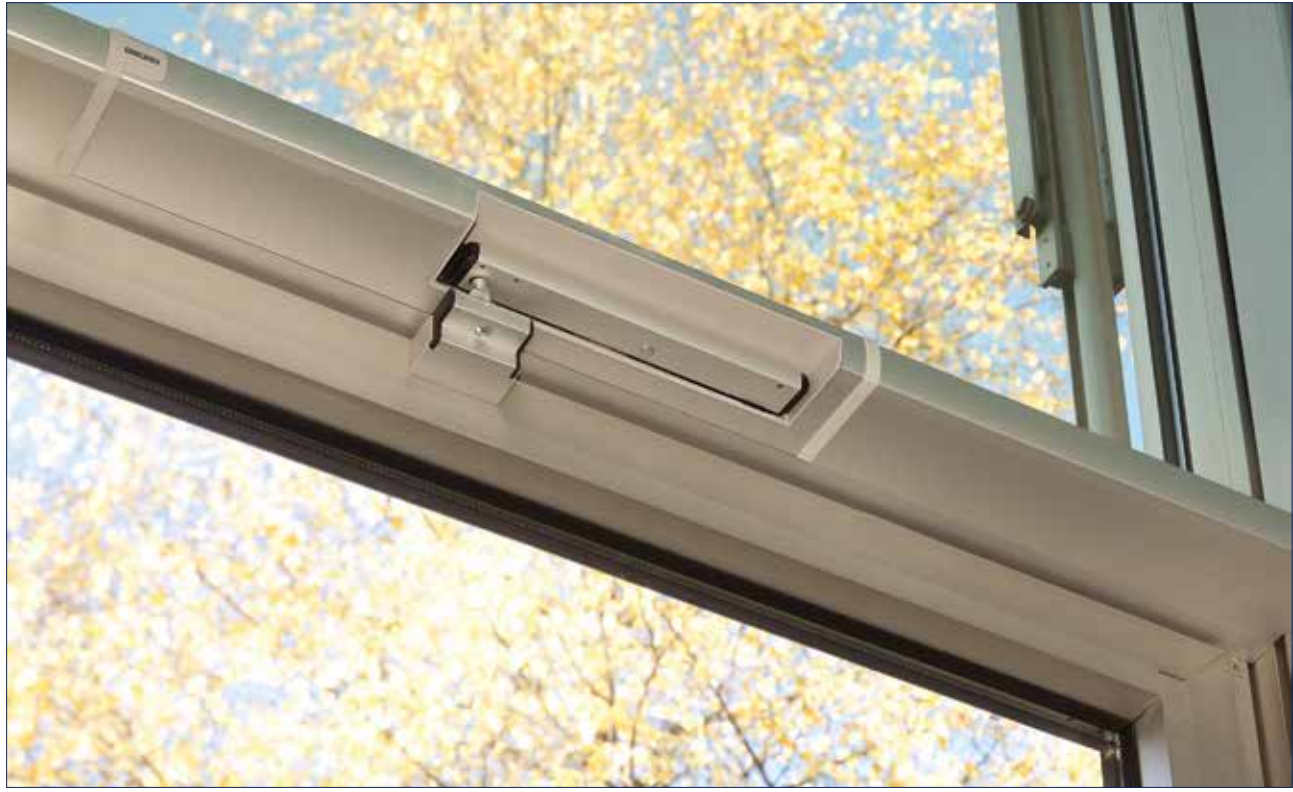
GEZE GmbH, Leonberg, Germany