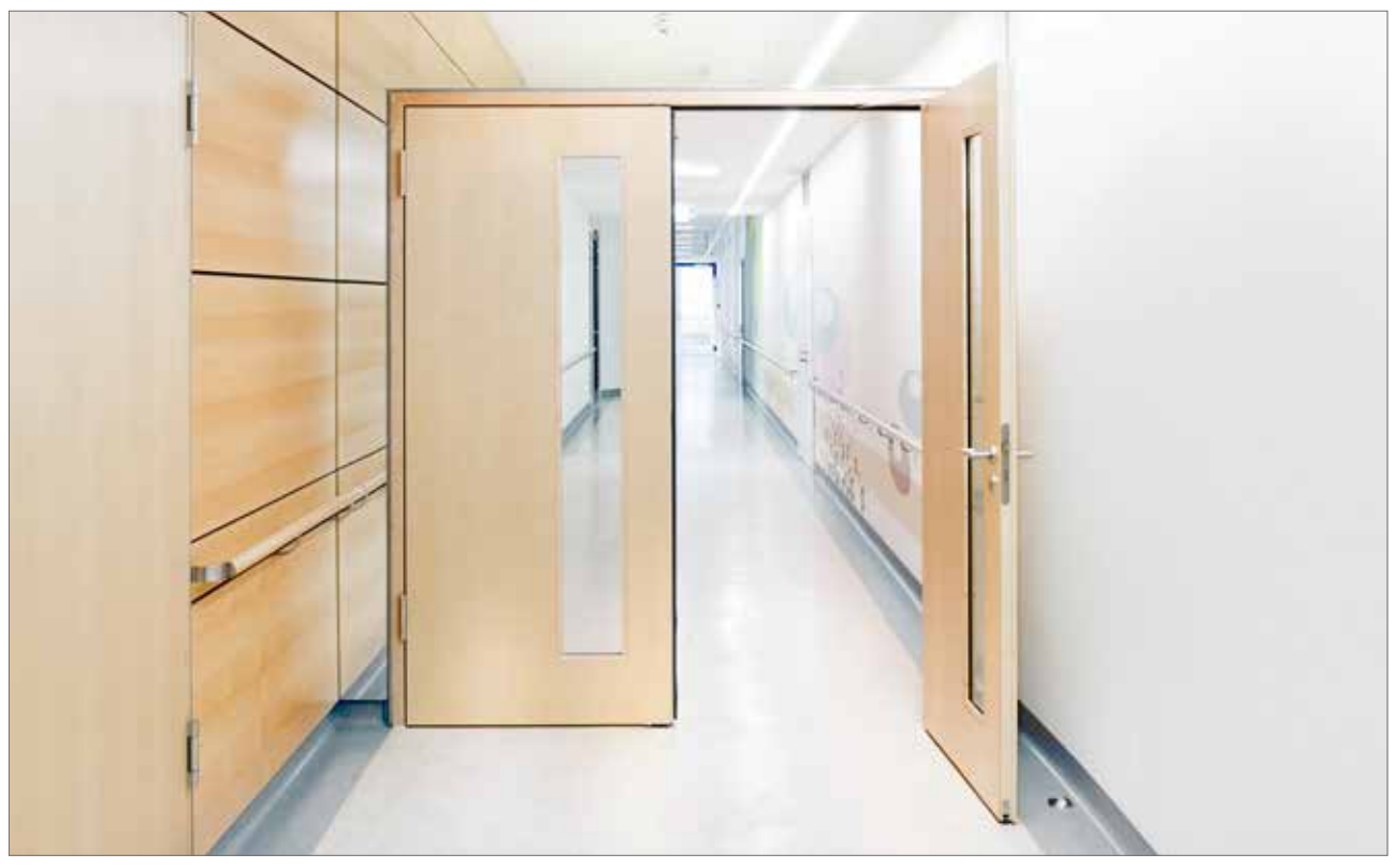
Robert Bosch Hospital, Stuttgart, Germany