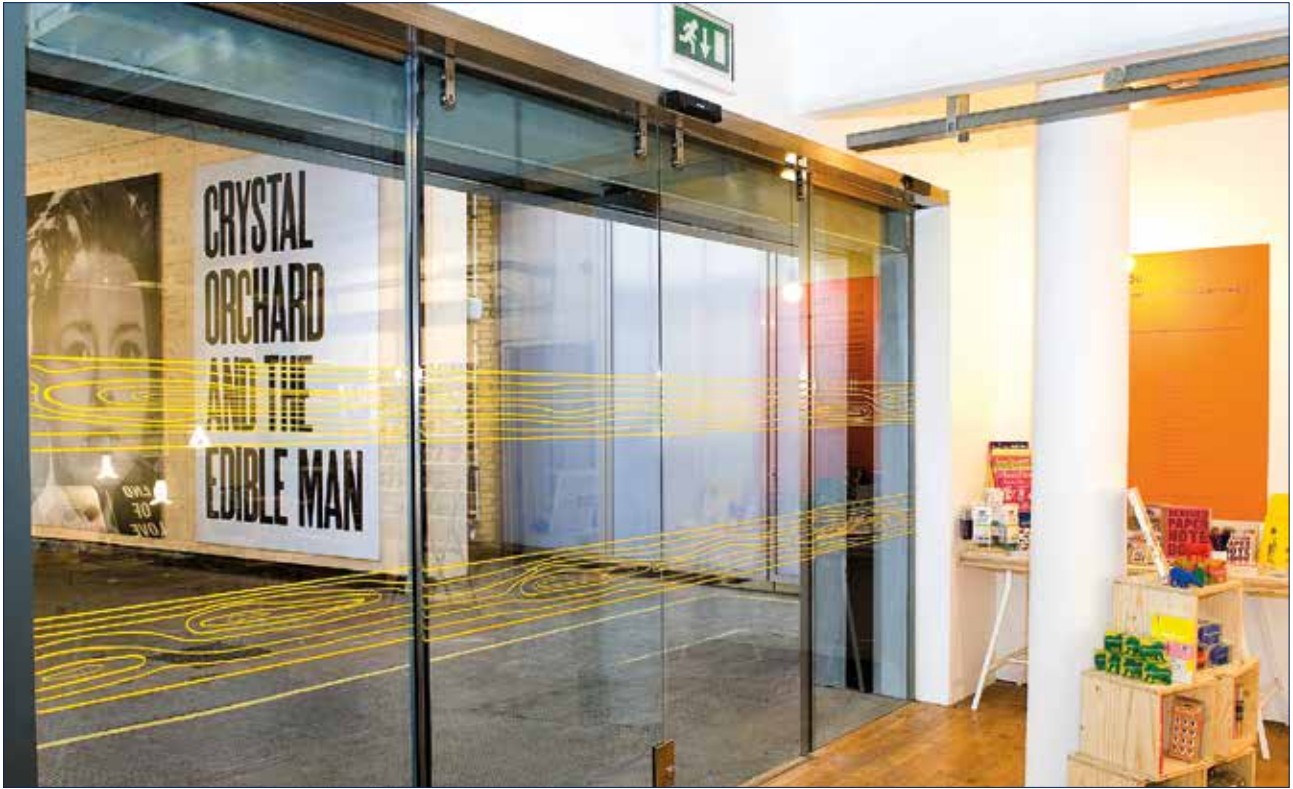
Modern Art, Oxford, Great Britain