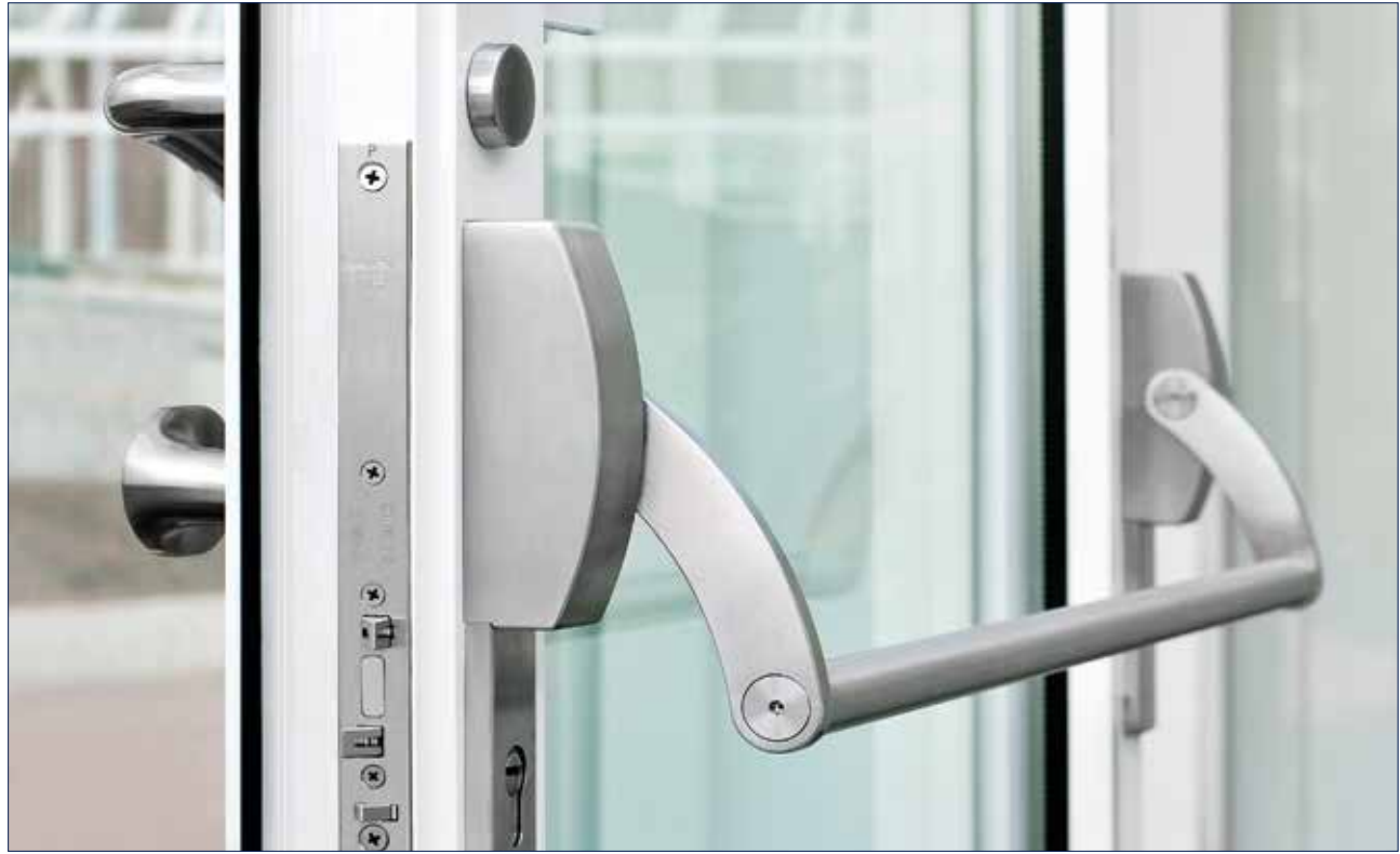
Academy of Finance, Bonn, Germany