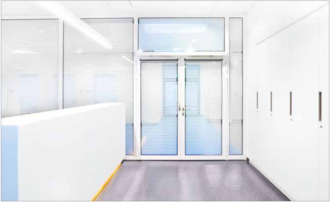
Düsseldorf Hospital, Germany