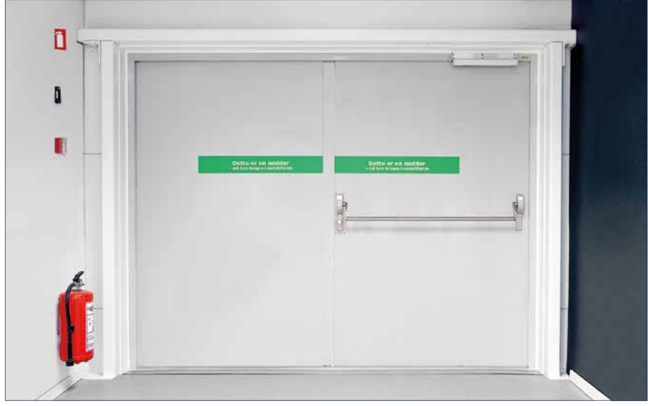
IKEA, Taastrup, Denmark