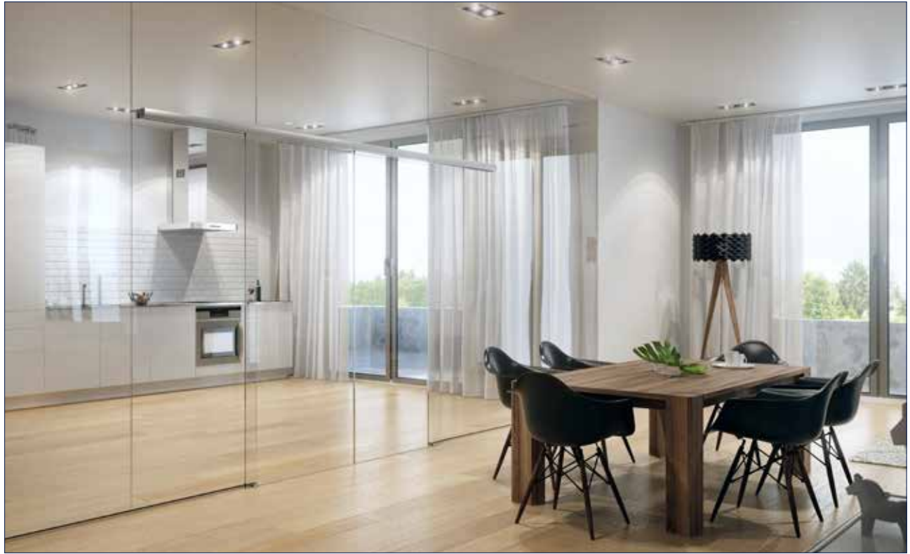
Installation situation, Residential building