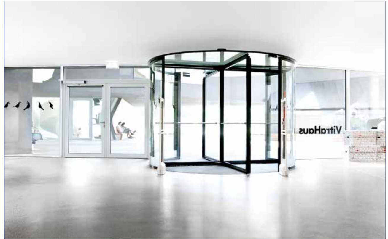
Vitra Haus, Weil am Rhein, Germany