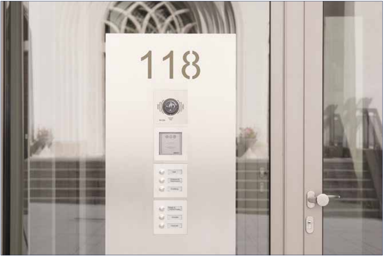
Catholic Church Administration Building, Stuttgart, Germany