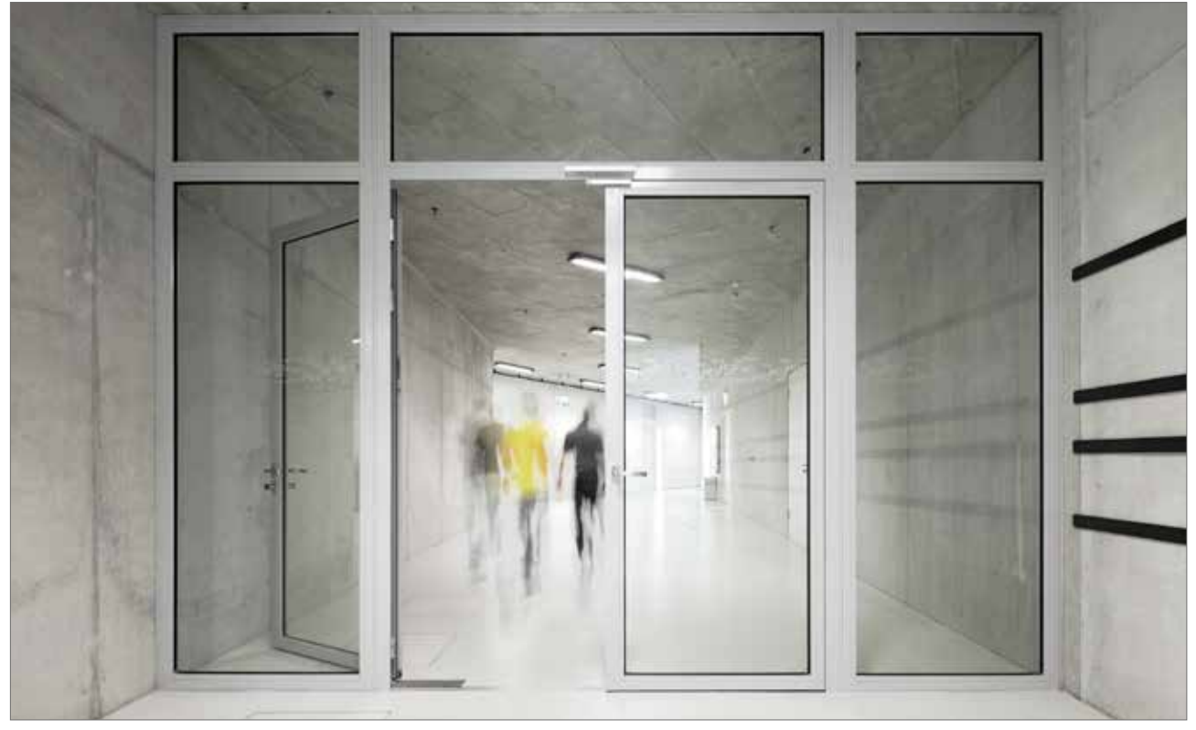
HafenCity University Hamburg, Germany