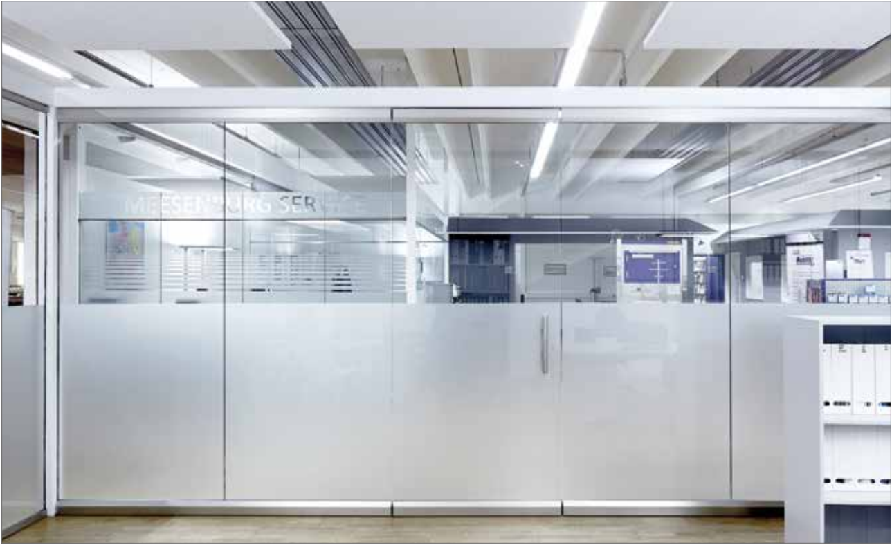
Meesenburg GmbH, Flensburg, Germany