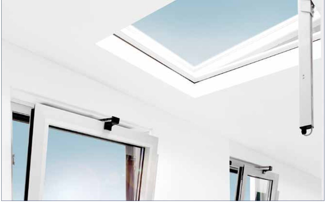
Installation situation