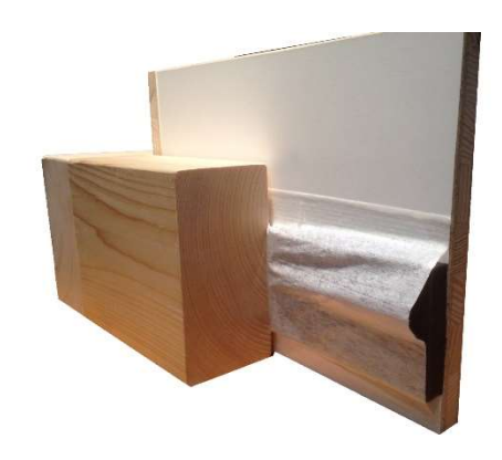
WDL insulation and sealing tape for an airtight connection between hatch box and ceiling