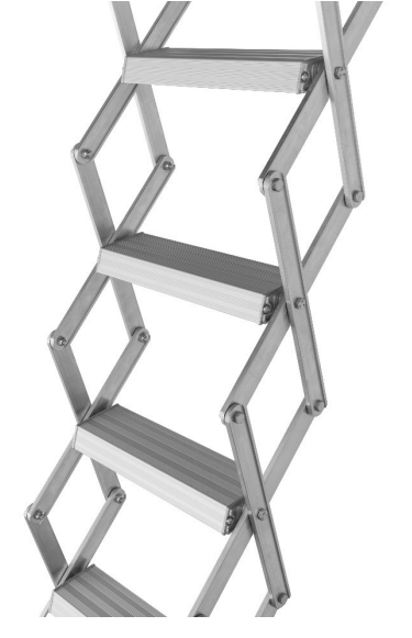
The Mini is manufactured from light-weight aluminium profile

Warranty: 2-year full warranty and 10-year parts warranty