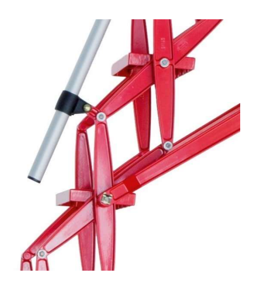
Supreme heavy duty aluminium loft ladder with optional red powder coat finish