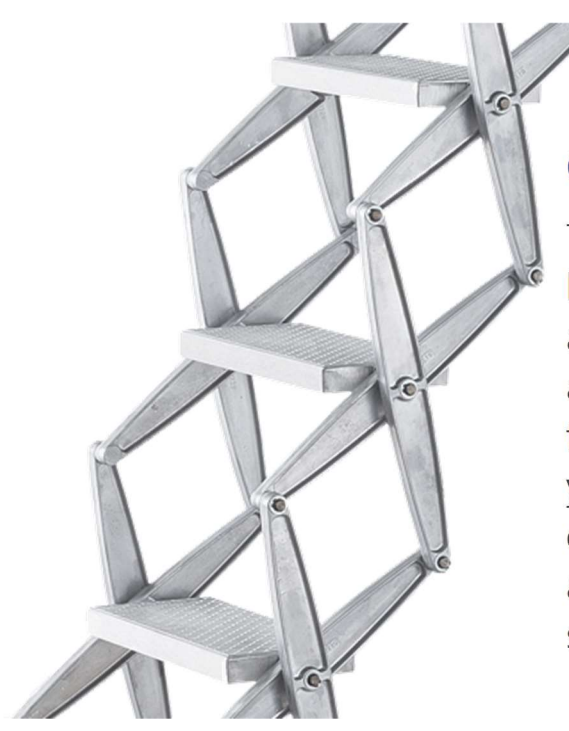
Supreme Vertical aluminium loft ladder with large steps for comfort and safety

Warranty: 2-year full warranty and 10-year parts warranty