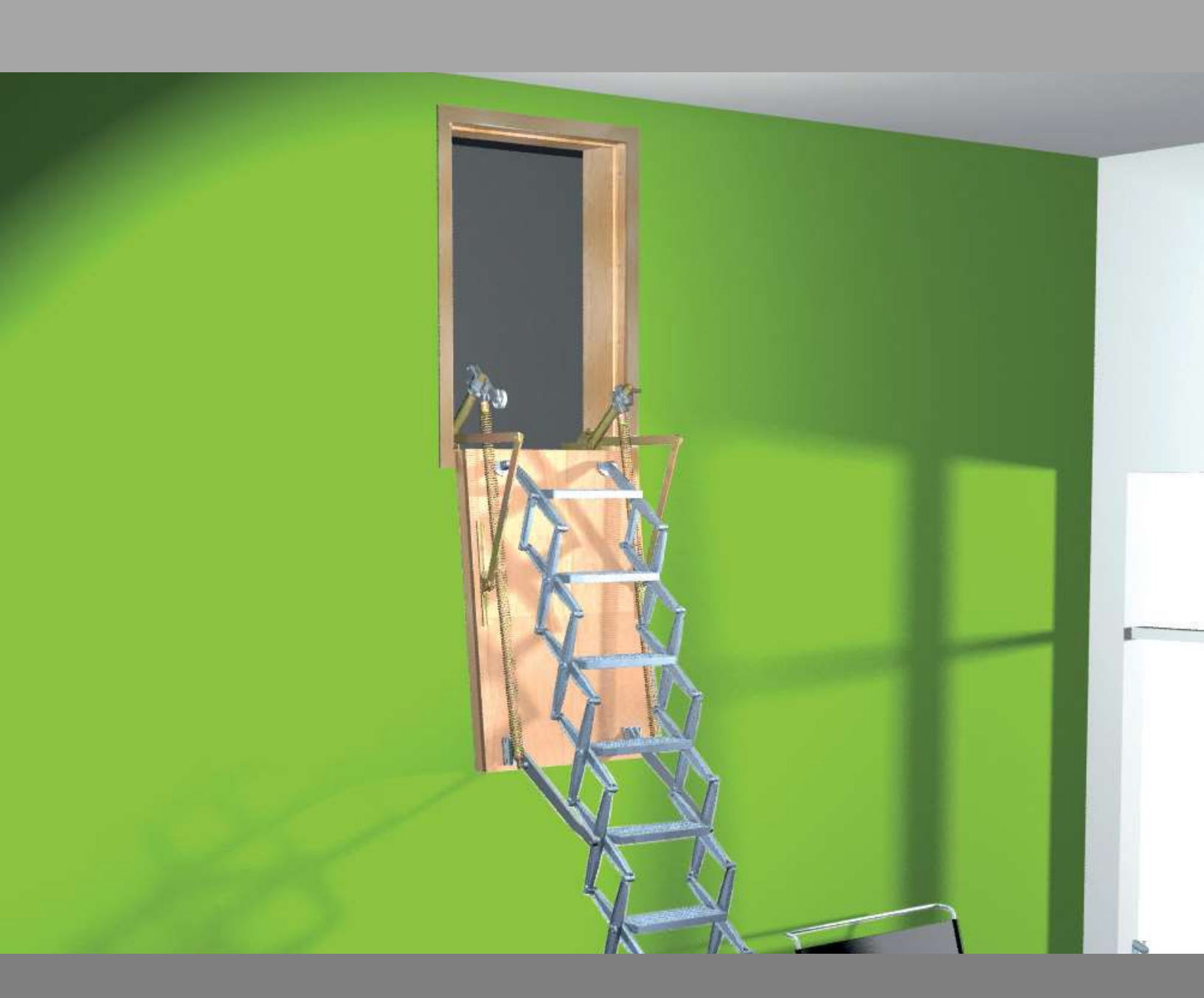
...lightweight, strength and durability