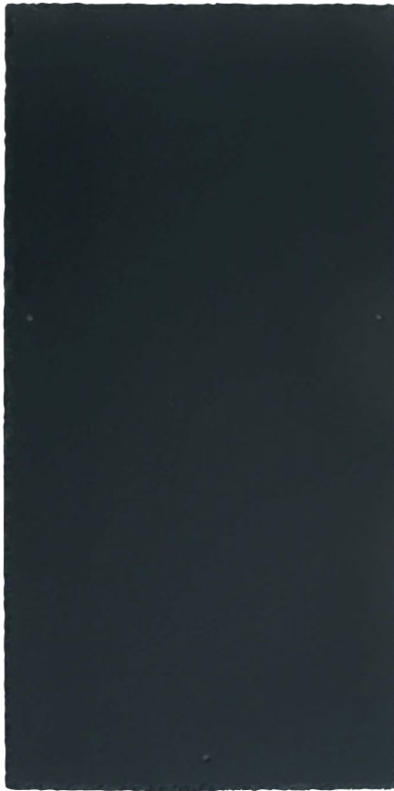
Blue / Black

Moorland slates are available in 600 x 300mm format, in Blue / Black colour, with a dressed edge.