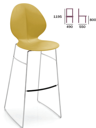
KA6S80 800mm seat height stool - Chrome