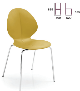
KA61 4 leg base - Chrome stacking chair