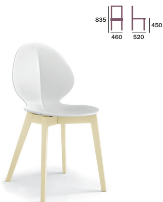
KA6BE1 Wooden 4 leg base - Beech