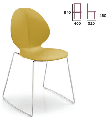
KA6S Skid base - Chrome stacking chair