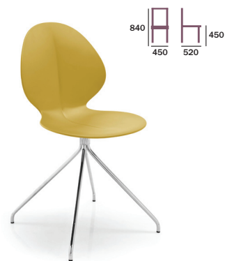
KA6SB4 Spider base - Chrome