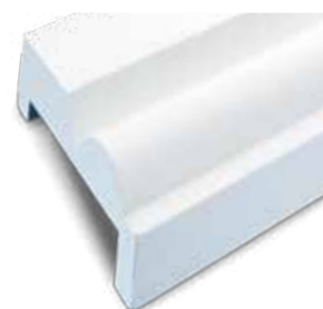
Torus 58mm & 69mm