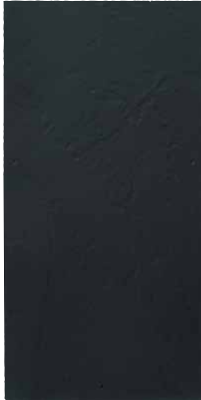
Blue / Black

Zeeland slates are available in 600 x 300mm format in Blue/Black colour, with a textured surface.