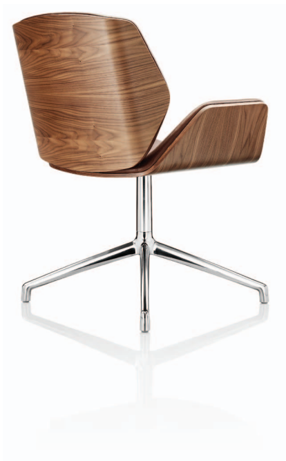
Black american walnut veneer with leather interior