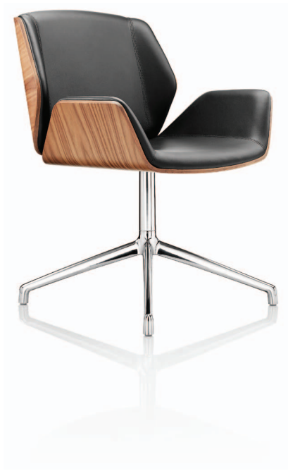
Black american walnut veneer with leather interior