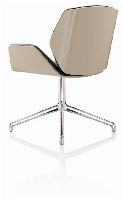
Satin polyurethane lacquer with leather interior