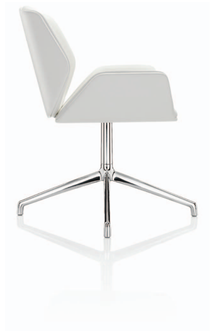
Fully upholstered in Elmosoft leather

The success of the Kruze range is largely due to the versatility that it offers the specifier. Chairs and stools can be supplied in any combination of fabrics, leathers, show-wood veneers, laminates