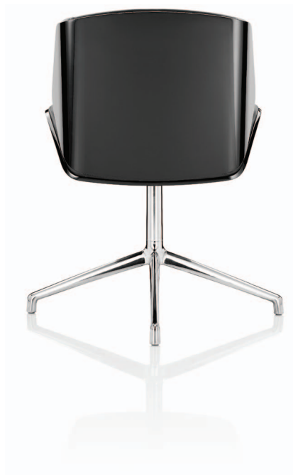
High-gloss polyurethane lacquer with leather interior