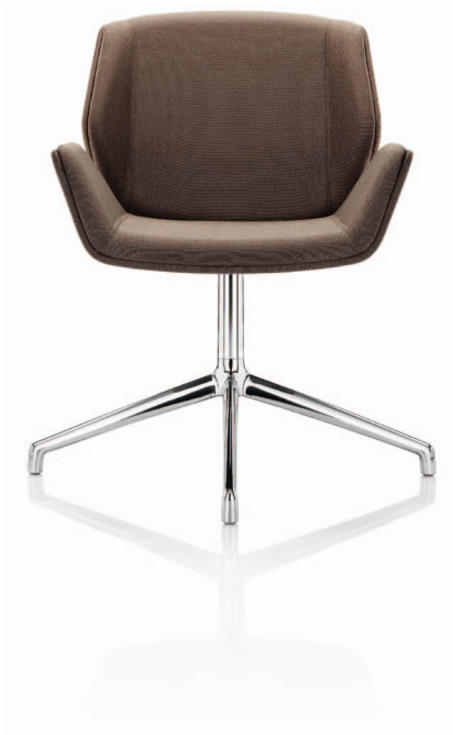
Fully upholstered in Designtex fabric