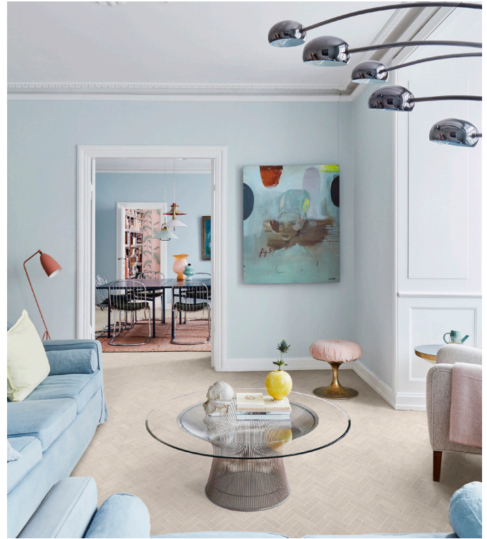
CROGIOLO_CONFETTO Azzurro Str. 3D Savoiaro 5x15