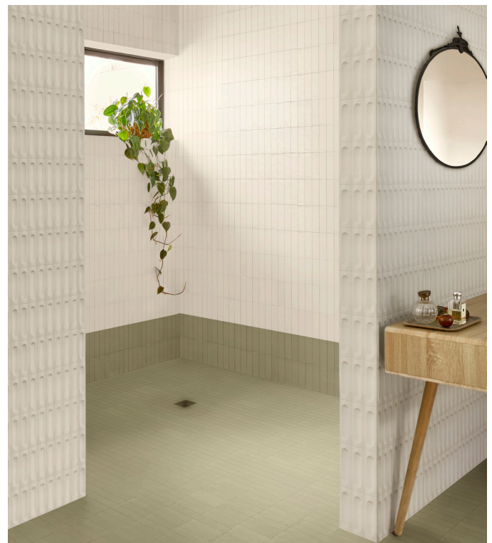
CROGIOLO_CONFETTO Salvia 5x15 WHITE DECO Decoro Roseto Touch 60x180