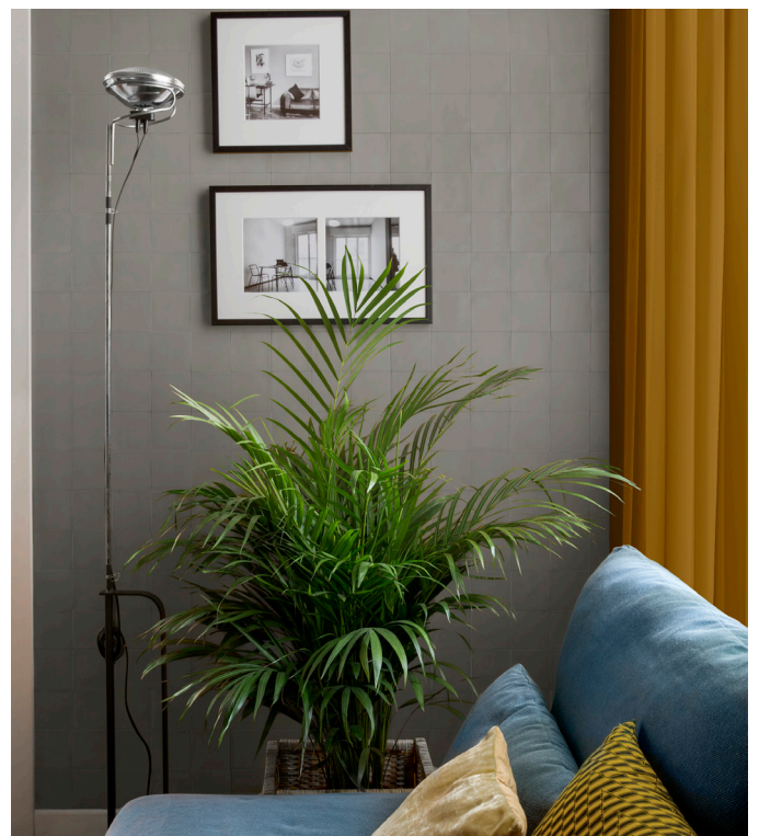
CROGIOLO_CONFETTO Mattone 10x10